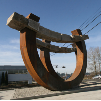
South Tacoma Station

SOUTH TACOMA Artist Ilan Averbuch was inspired by Union Station in downtown Tacoma, and by the historical museum that developed in its light. The upside-down arches appear as a reflection in water of the arches of Union Station. The image of reversed steel arches, with their “piece of land” stretched at the top, recalls the wheels of the steel trains that developed the northwest. The curves suggest the sound of steel wheels and the left-right rhythm of a train ride.