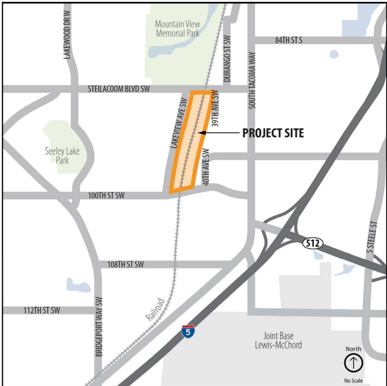
Figure 1 Project Vicinity Map