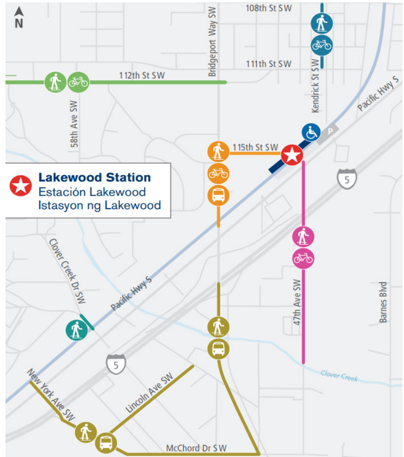
This map shows some of the proposed improvements for accessing the Lakewood Station.