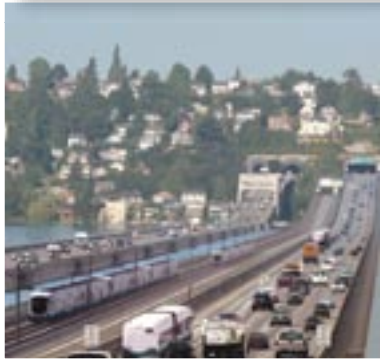
(From top to bottom) A welder at work in the Downtown Seattle Transit Tunnel retrofit; Conceptual image shows future light rail trains on I-90 connecting East King County to Seattle; Sounder train arrives at the Auburn Station.

For more information contact Sound Transit at Union Station, 401 S. Jackson St., Seattle WA 98104. Or call 1-800-201-4900 / 1-206-713-6030 TTY. Visit our Website at www.soundtransit.org