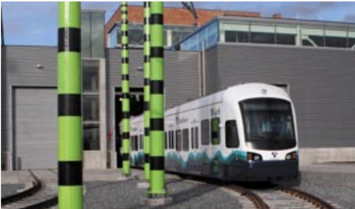
The first Sound Transit Link light rail car rolls out of the new Link Operations and Maintenance Base in the SODO area of Seattle. This is the first of 35 light rail vehicles arriving in Central Puget Sound for final assembly, testing and then service.

The 2006 milestones are a valuable tool for charting Sound Transit's achievements throughout the year.