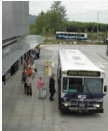
Commuters board a ST Express bus at the Issaquah Highlands Park-and-Ride lot, which opened the winter of 2006.