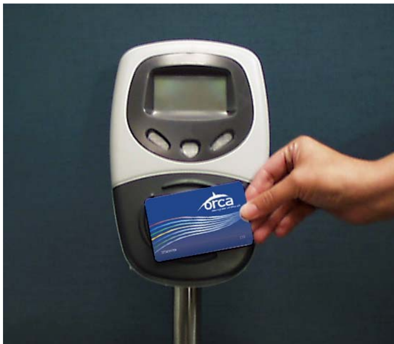
ORCA is Near

Activities in this quarter focused on coordinating the interdepartmental Matrix Team's review of Sound Move and ST2 program implementation, progressing bicycle policy revisions to the Board, and completing the RFP for Sounder parking pricing analysis. Work also began on developing guidelines for the new ST2 System Access Program, and a consultant was selected to support ridership forecasting modeling over the next two years.