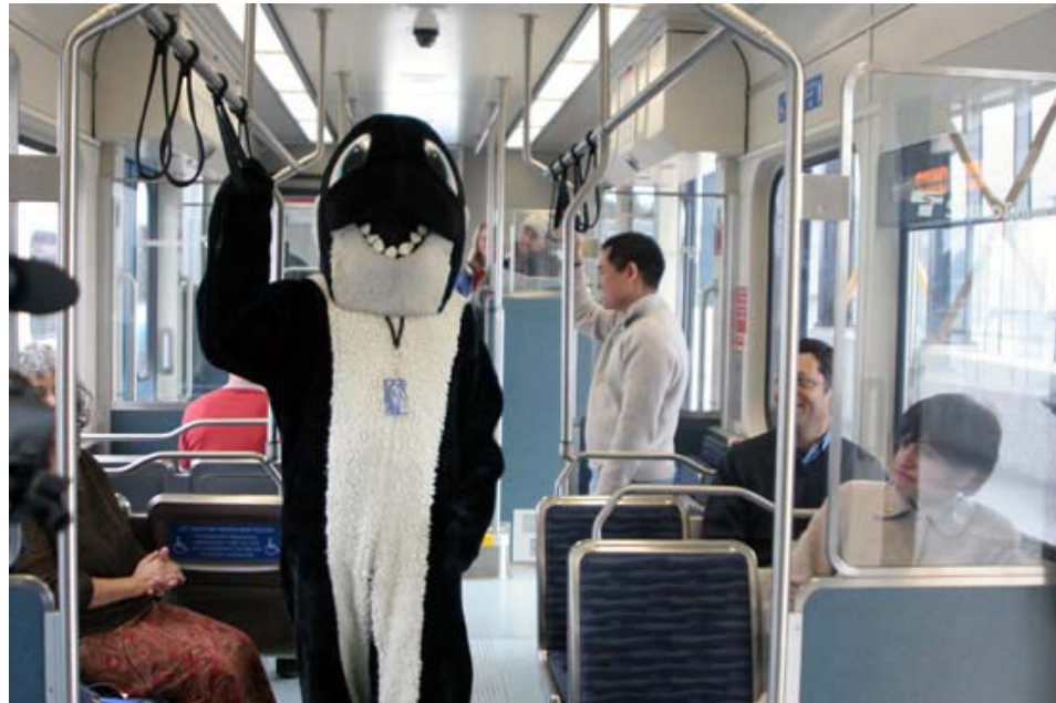
Steve, the ORCA mascot, test riding Link Light Rail opening in July 2009.

The Regional Fare Coordination ("Smart Card - ORCA") Project is a joint effort between Sound Transit Community Transit, Everett Transit, Kitsap Transit, King County Metro Transit, Pierce Transit and Washington State Ferries. The project will replace all regional fare collection equipment and processes with an automatic system for collecting and distributing fare/pass sale revenue. It will also replace most non-cash fare media with Smart Cards.