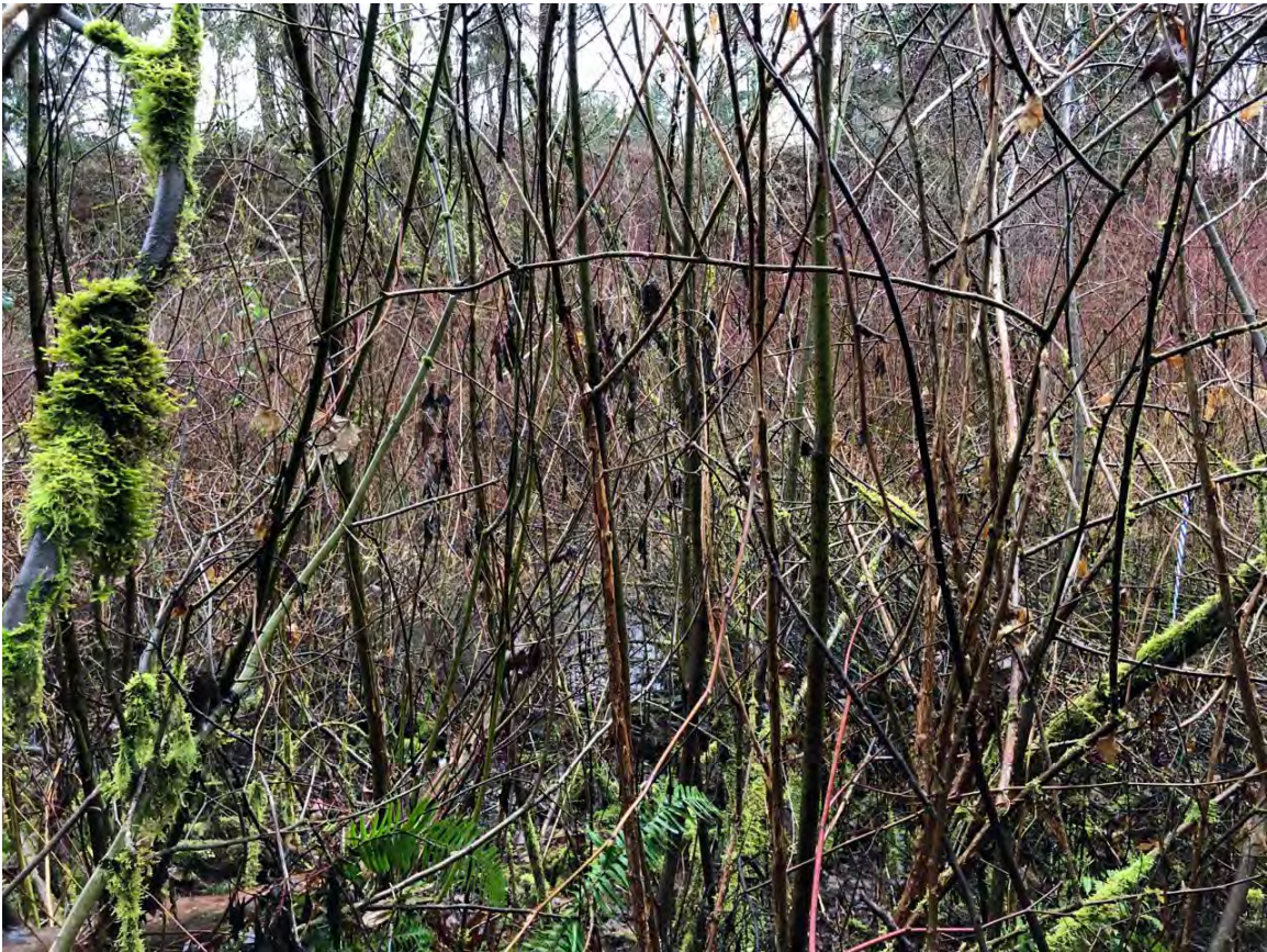
5. Native Brush Land Cover Type