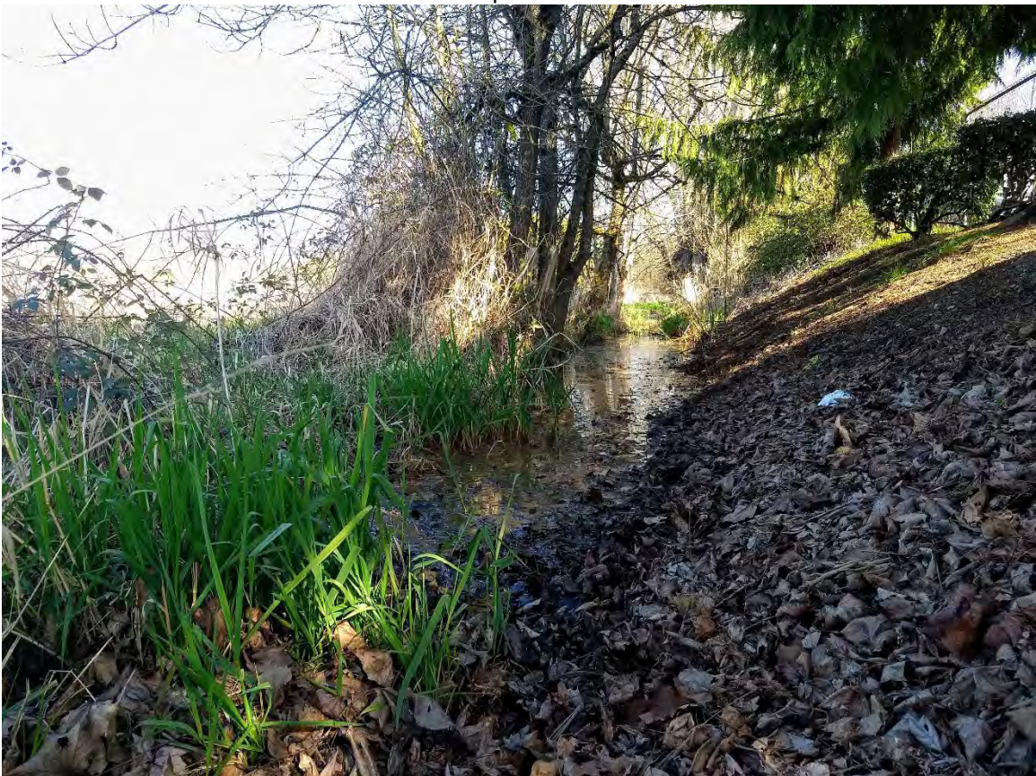
25. Fife Ditch Tributary 1