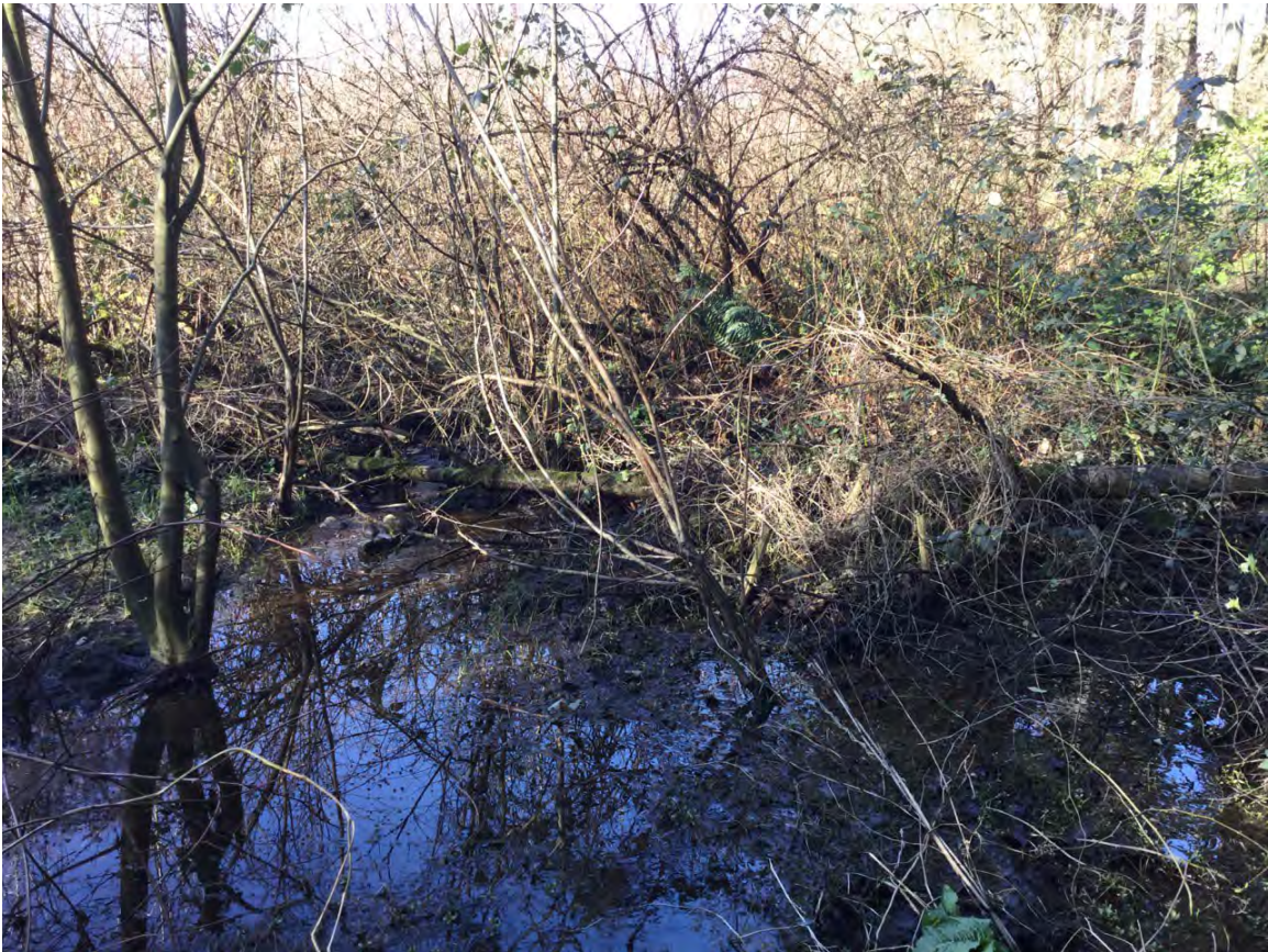
11. Scrub-shrub Wetlands