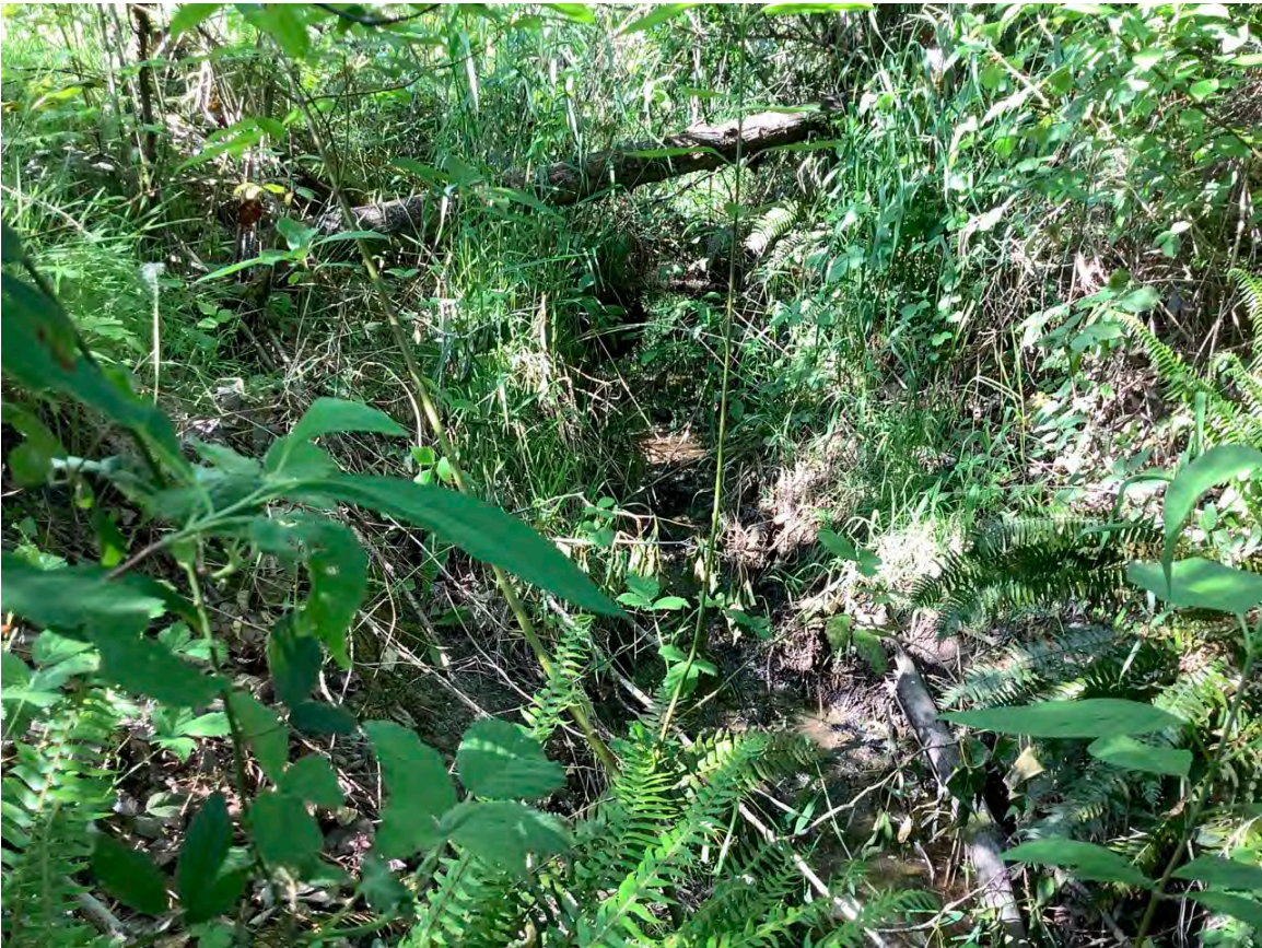
20. Middle Fork Hylebos Creek