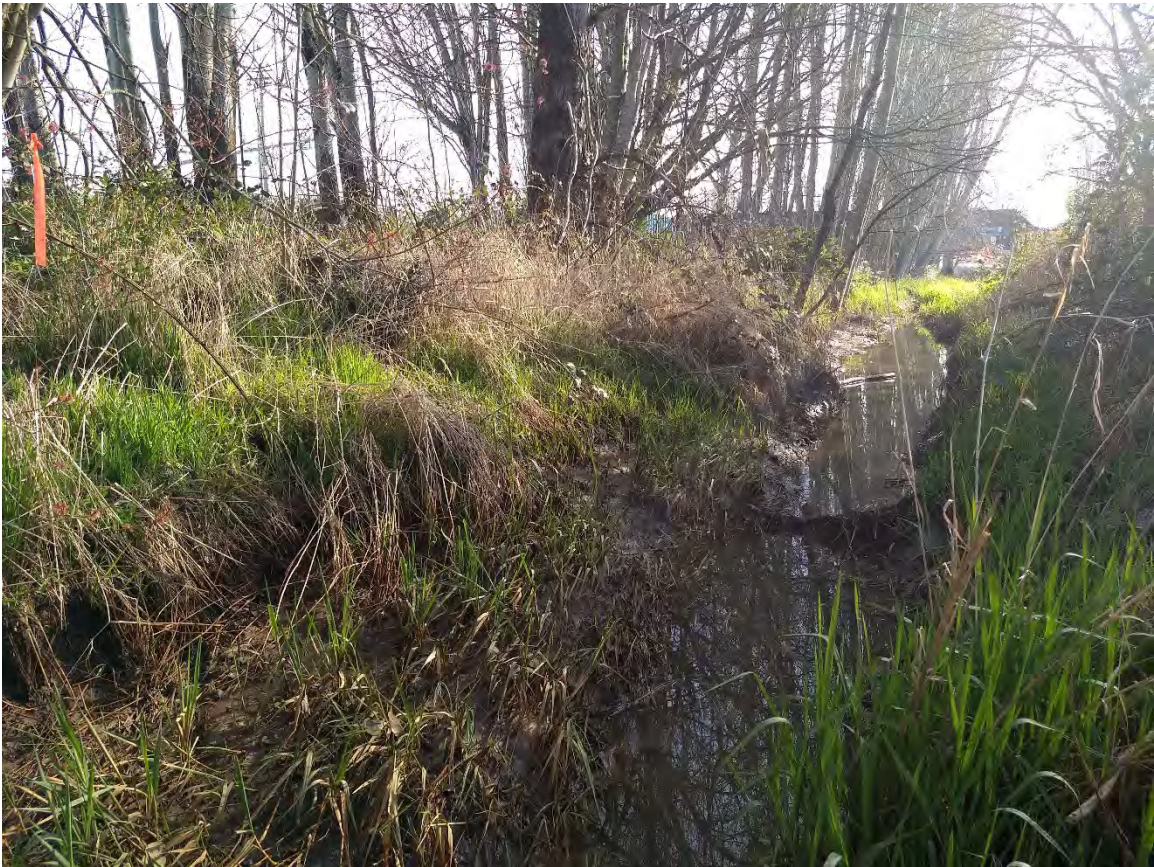
28. Erdahl Ditch Tributary 1