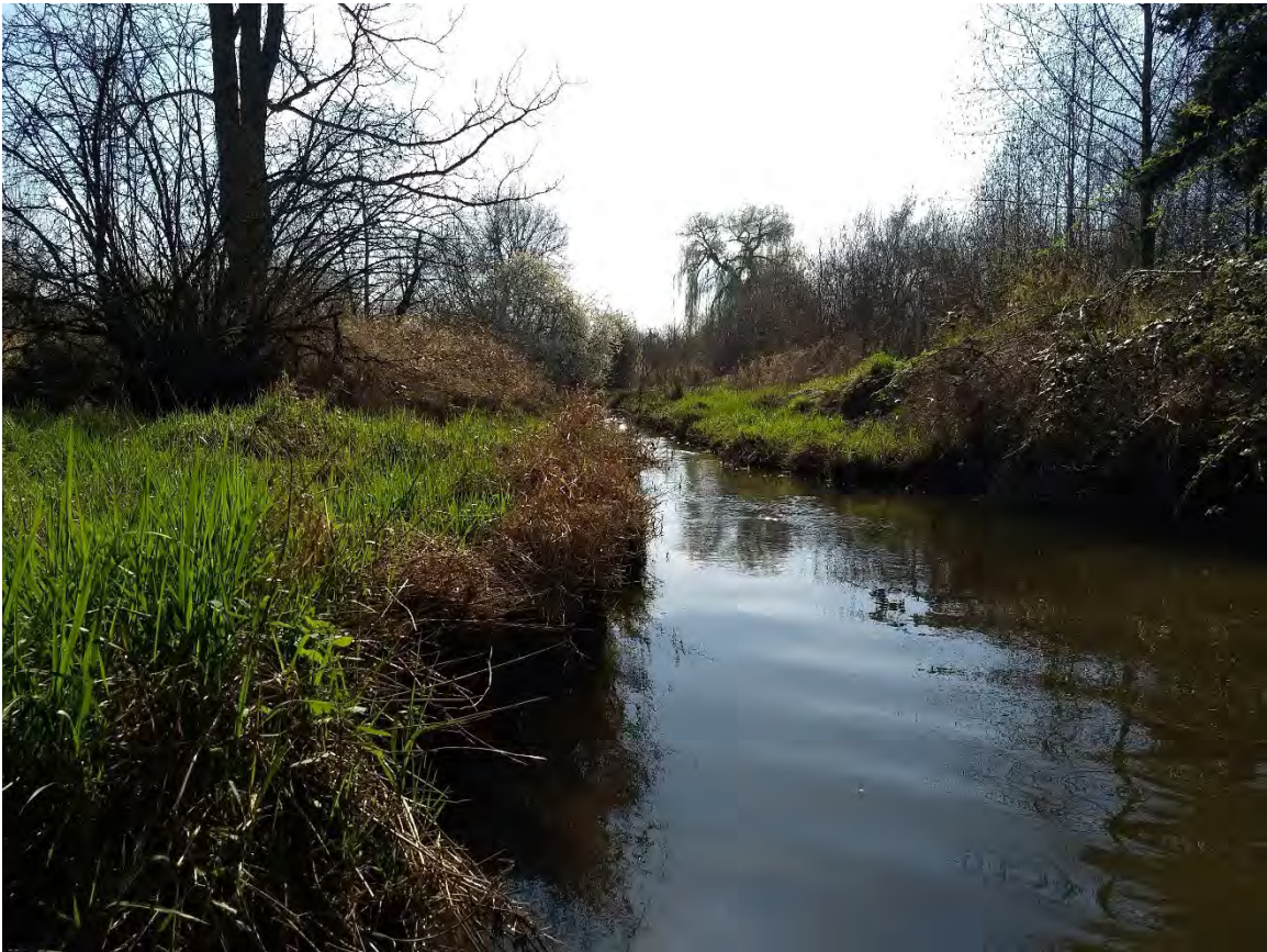
24. Surprise Lake Creek