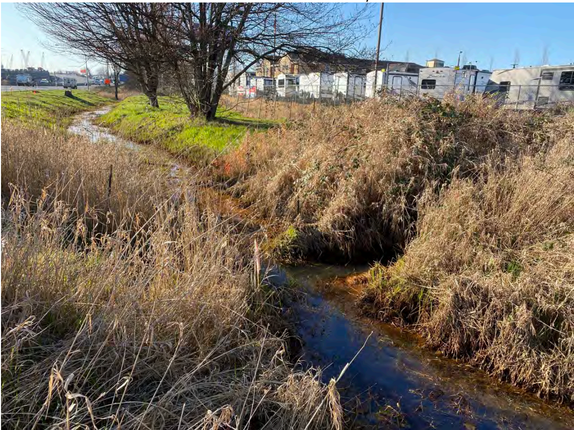
29. Erdahl Ditch Tributary 2