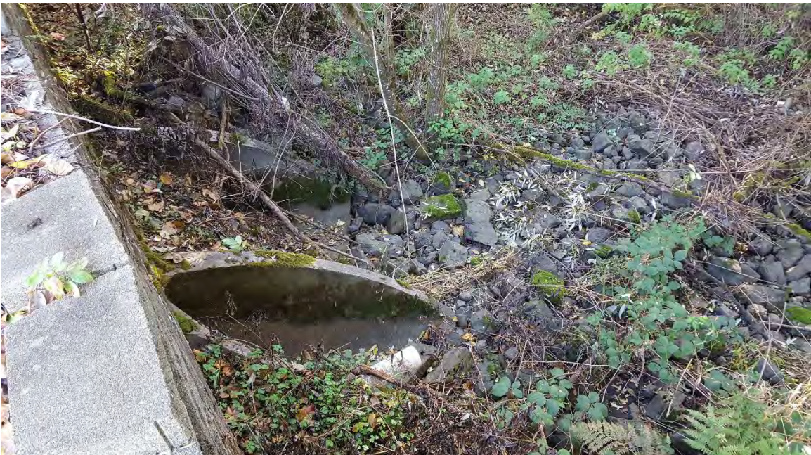
14. West Fork Hylebos Creek Tributary 0014C