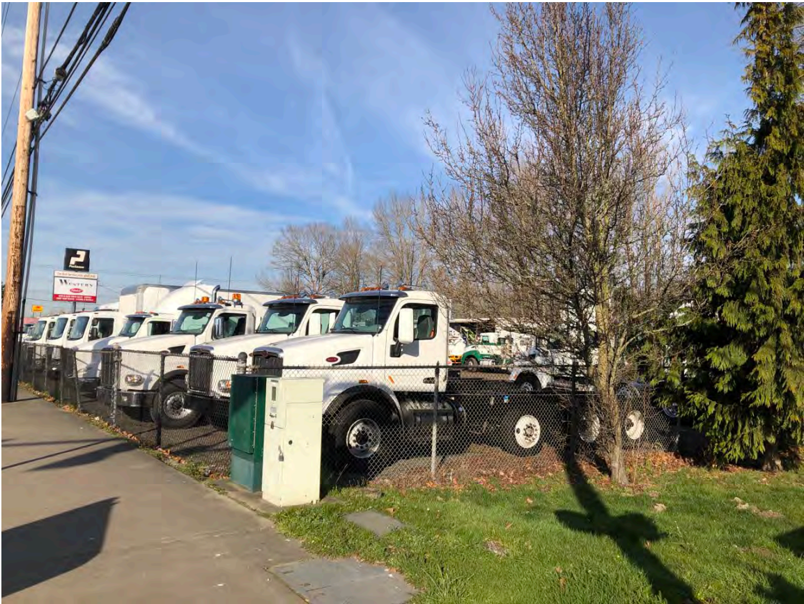
1. Commercial Land Cover Type