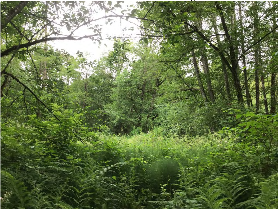
10. Forested Wetlands