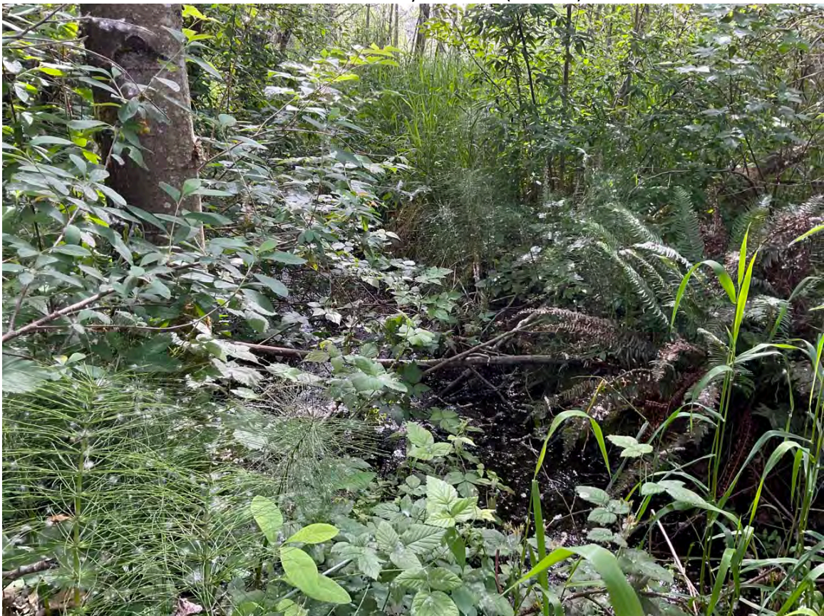
18. Federal Way Stream 3 (SFW-03)