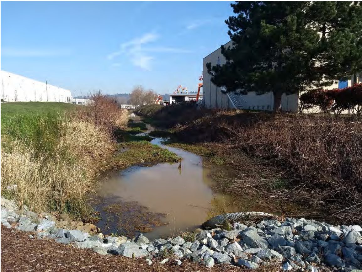
26. Fife Ditch