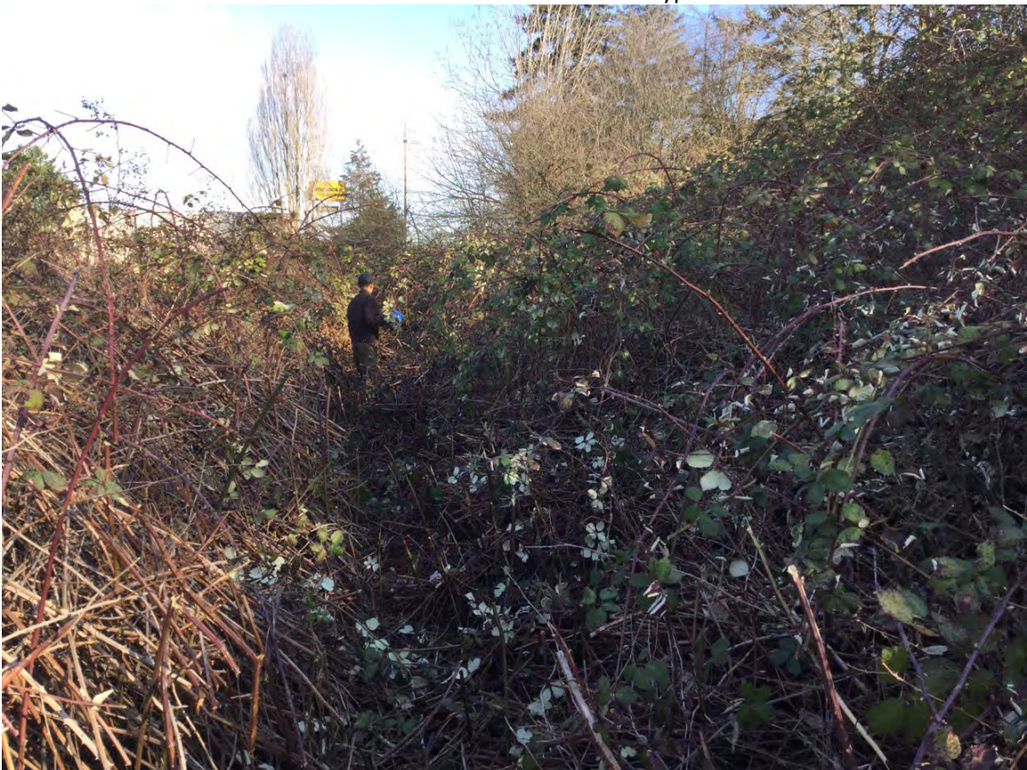
4. Invasive Brush Land Cover Type