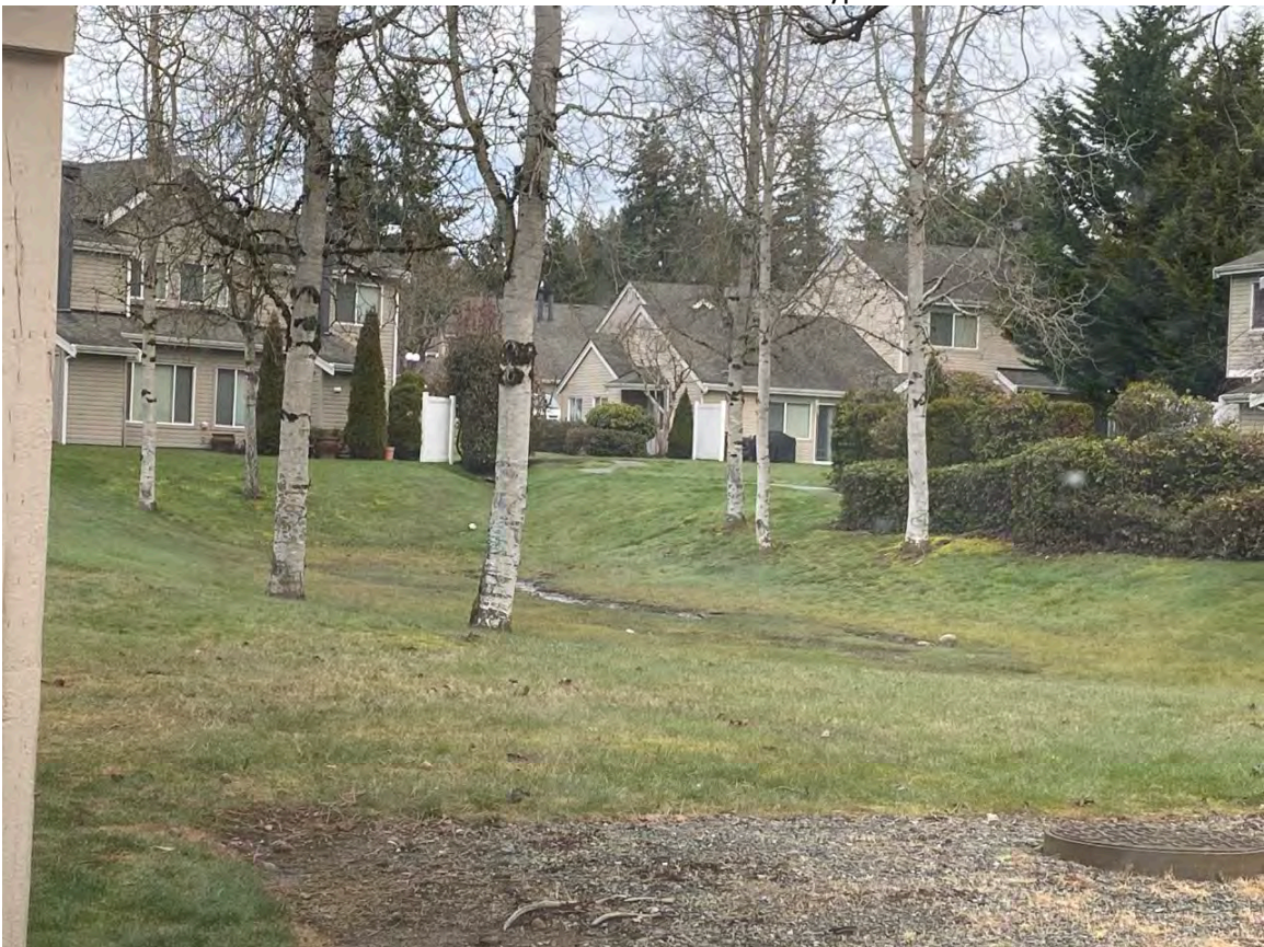
2. Residential Land Cover Type