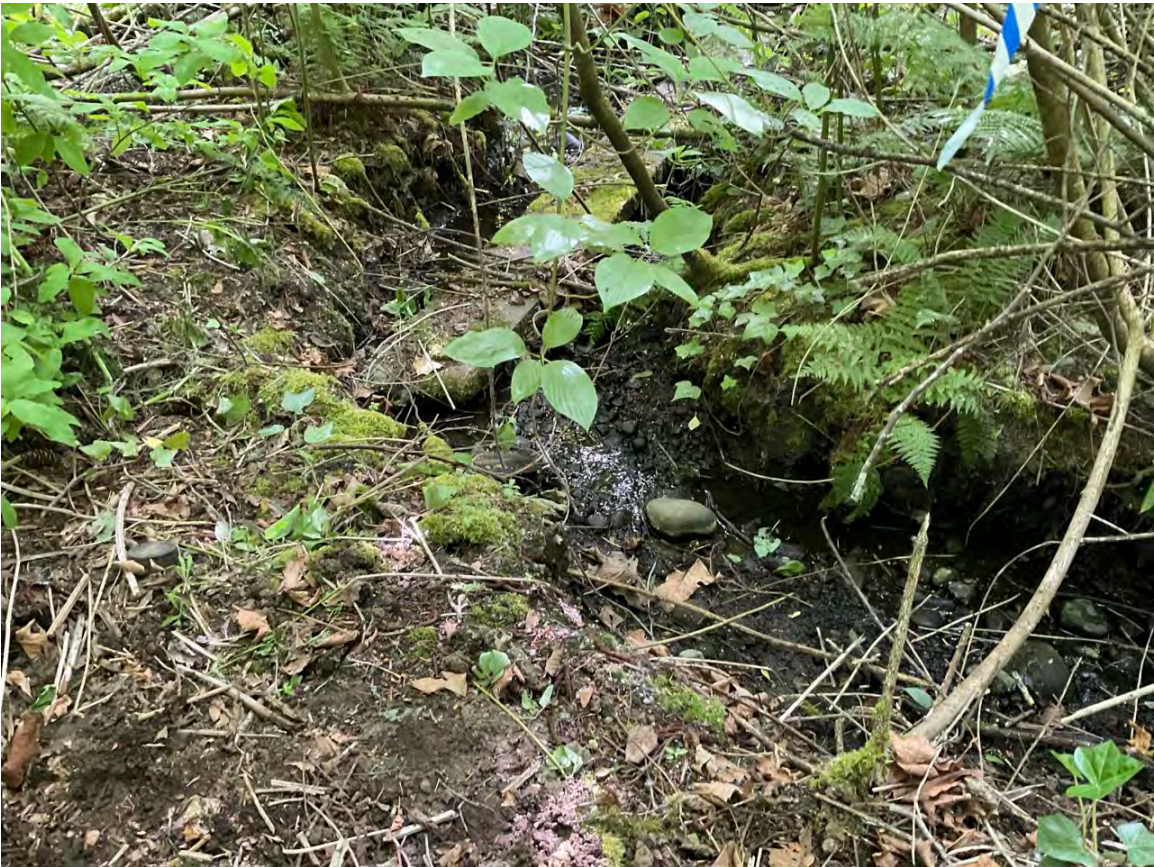
22. Milton Stream 2 (SMI-02)