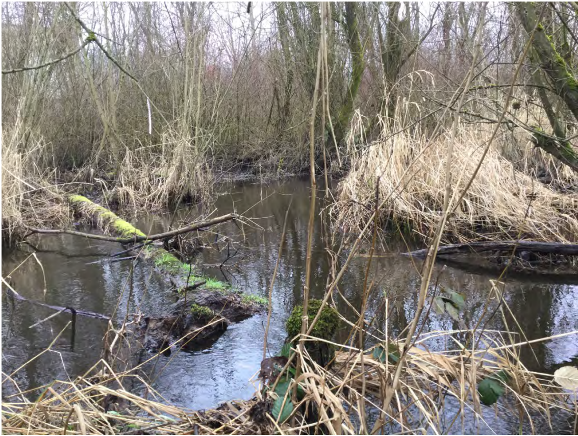
15. West Fork Hylebos Creek