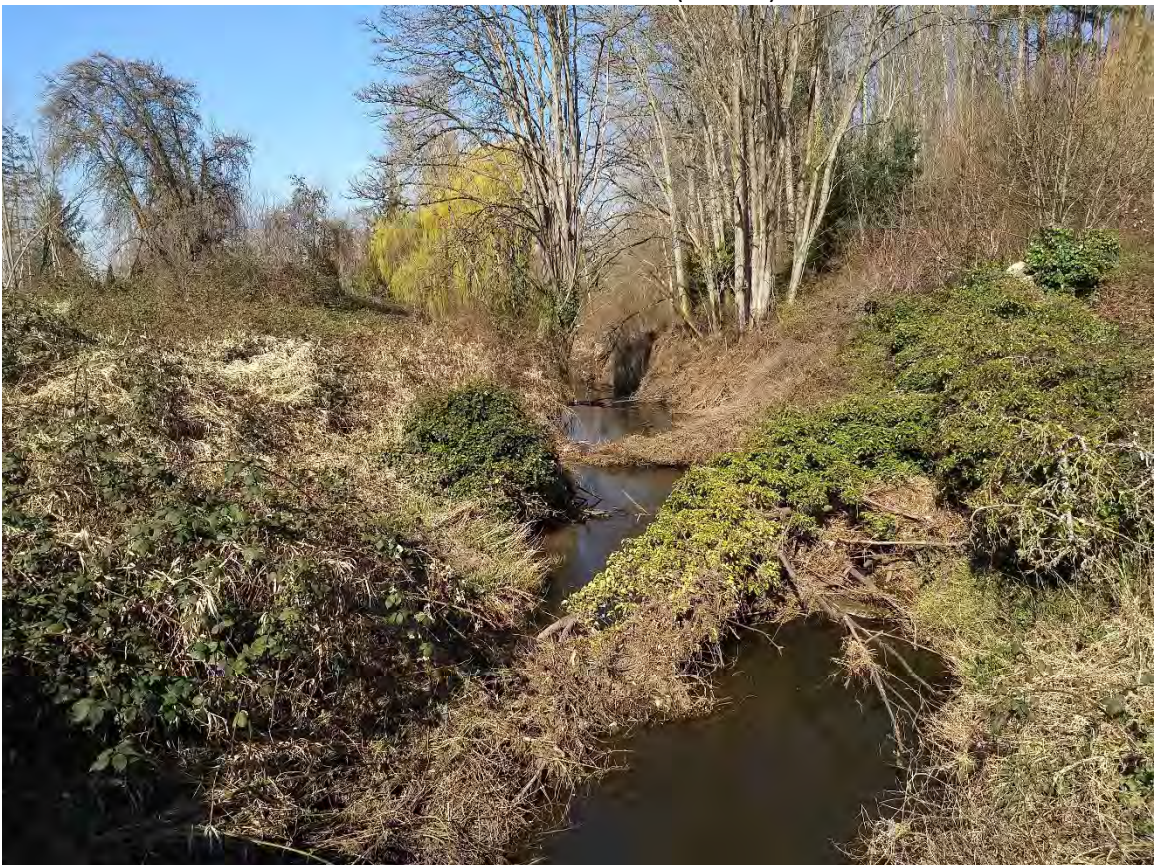
23. Hylebos Creek