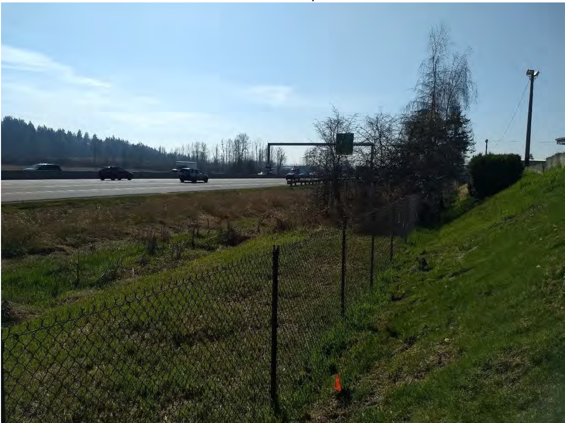
21. Milton Stream 1 (SMI-01)