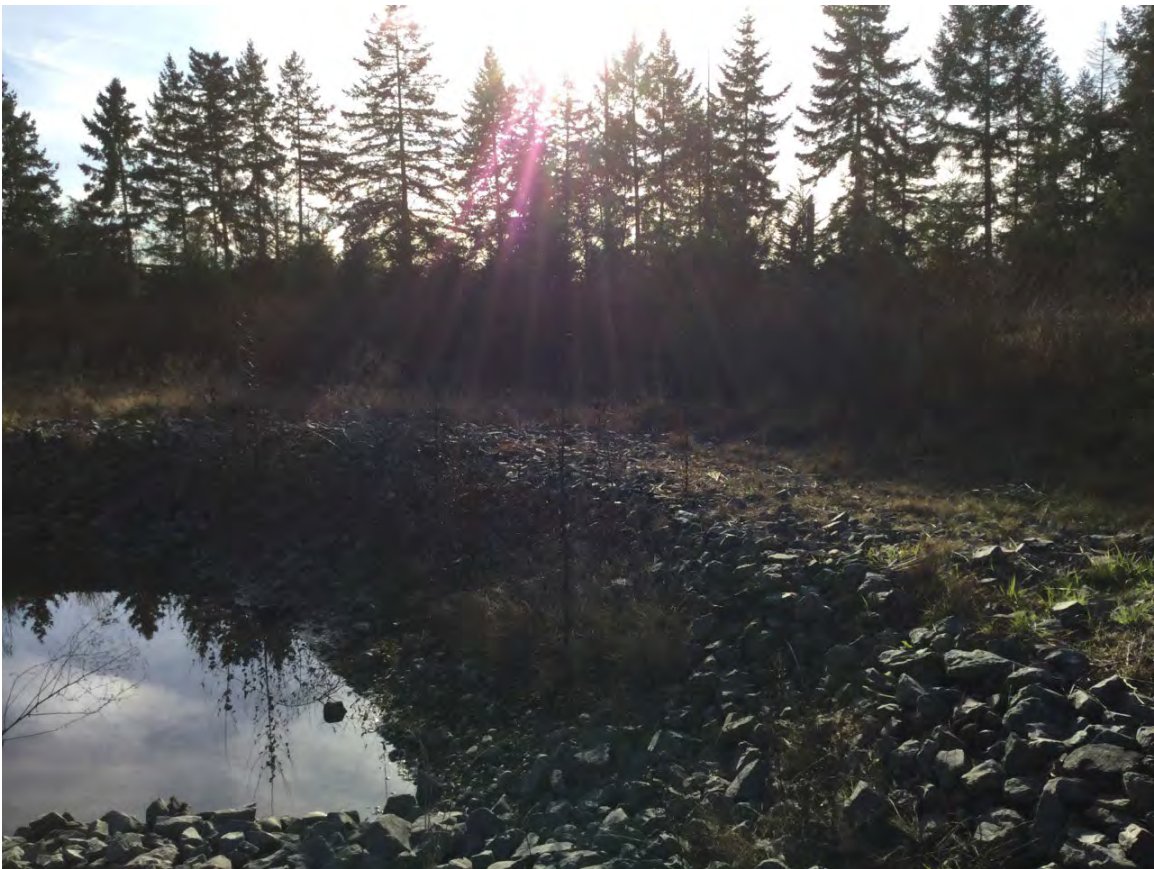
9. Stormwater Pond Land Cover Type