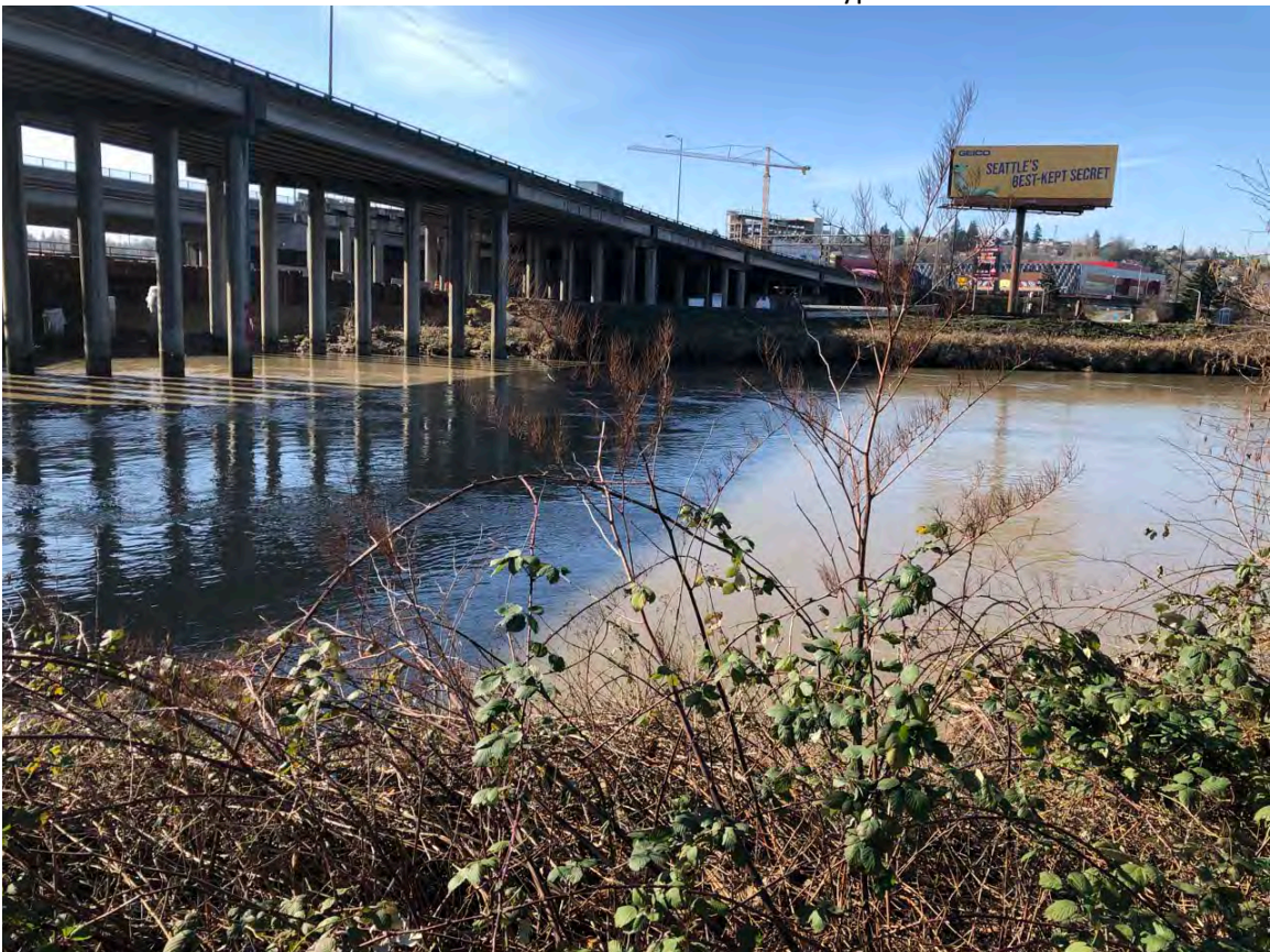
8. River Channel Land Cover Type