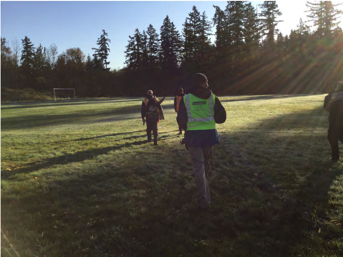
3. Grassland Land Cover Type