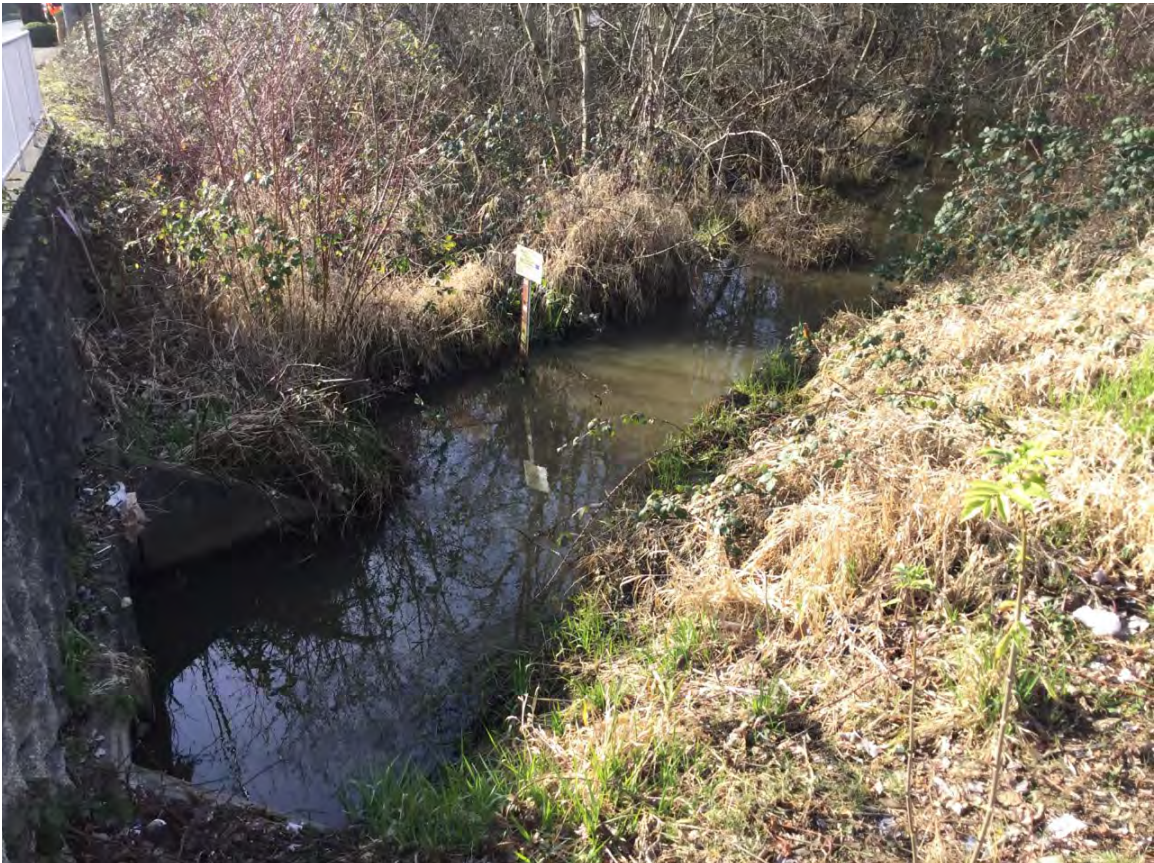
27. Wapato Creek