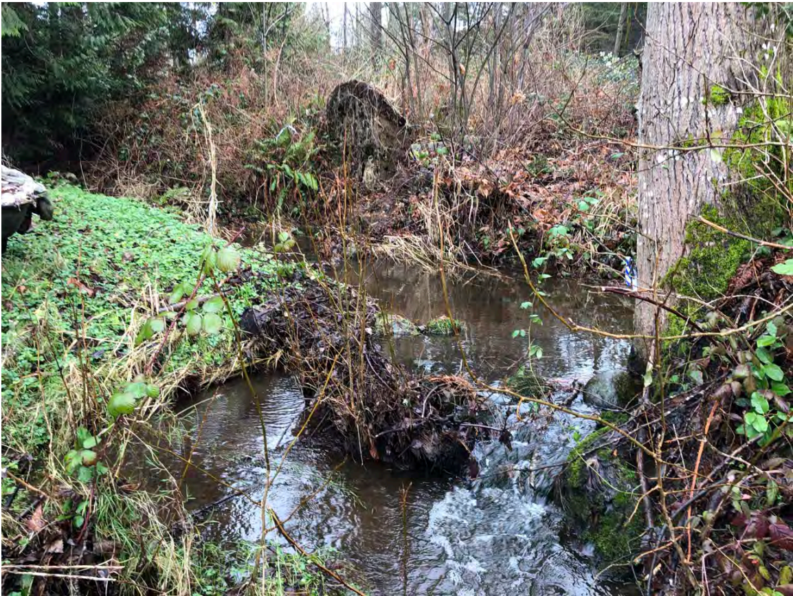
13. East Fork Hylebos Creek Tributary 0016A