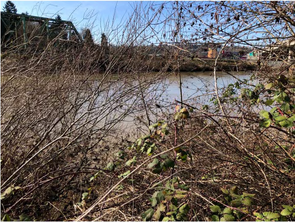
30. Puyallup River