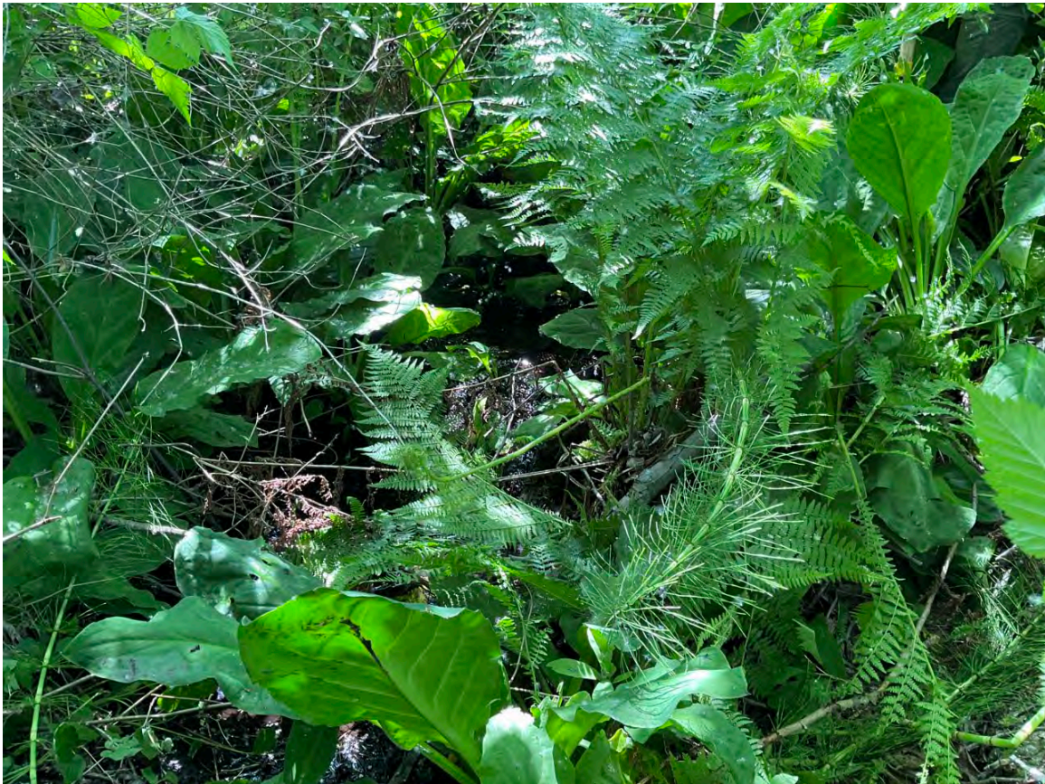
17. Federal Way Stream 2 (SFW-02)