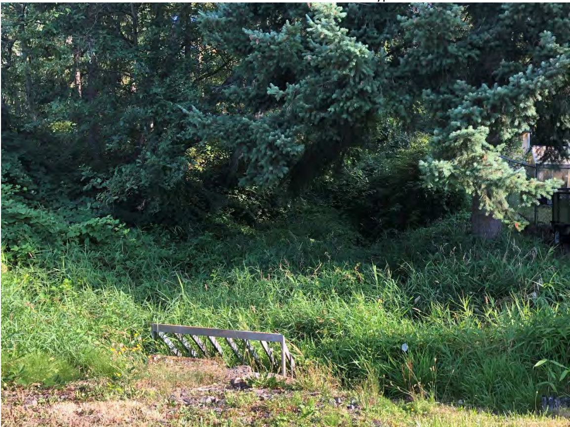
6. Non-native Forest Land Cover Type