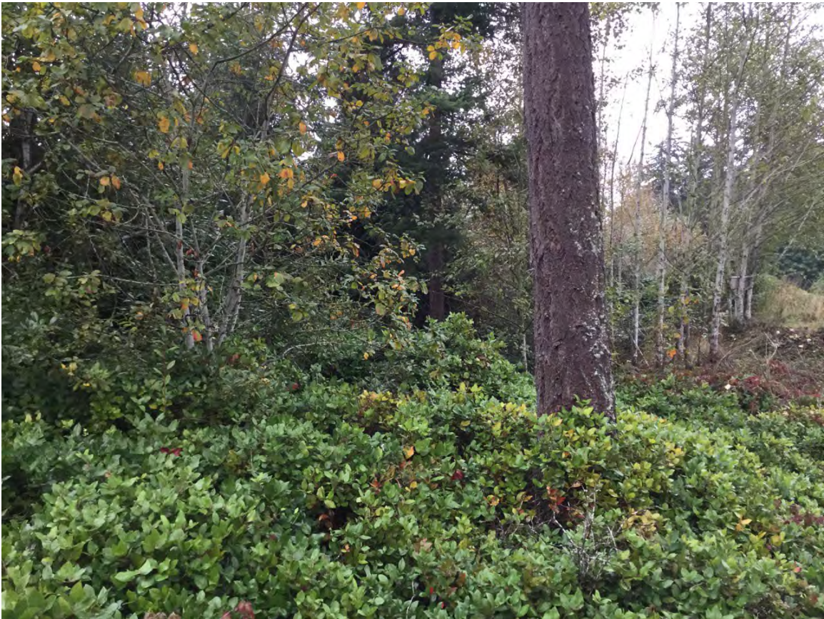
7. Native Forest Land Cover Type