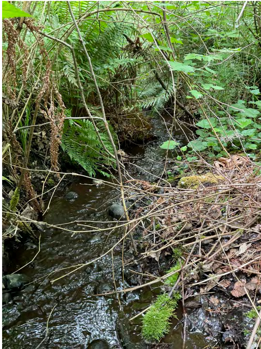
19. Federal Way Stream 4 (SFW-04)