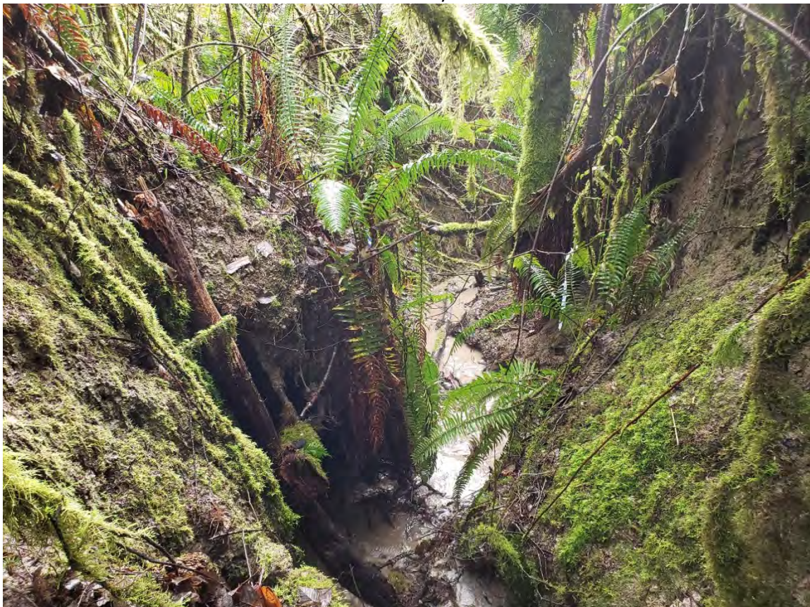
16. Federal Way Stream 1 (SFW-01)