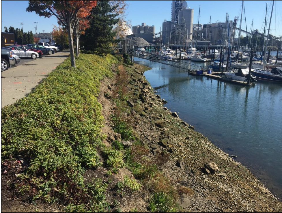
Figure N4.D-17. Vegetation Adjacent to Southwest Andover Street (south side) Taken January 23, 2020.