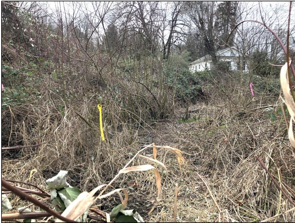
Figure N4.D-23. Beaver Dam in Longfellow Creek at Wetland WSE2