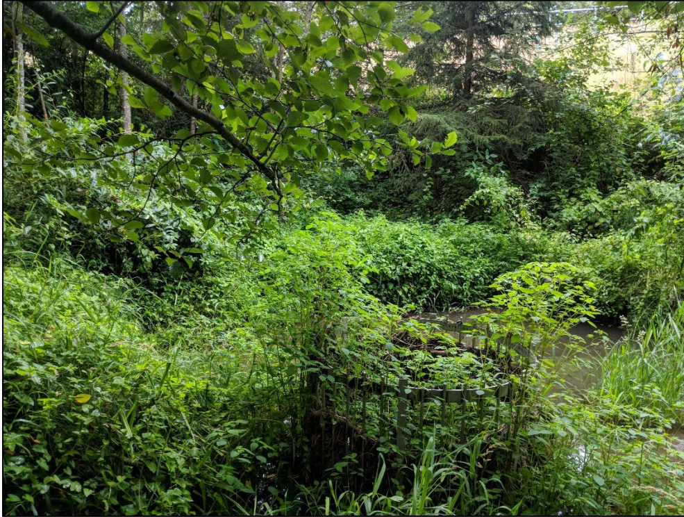
Figure N4.D-4. Wetland WSE4

Facing south, by the water control structure in Longfellow Creek, taken July 15, 2019.