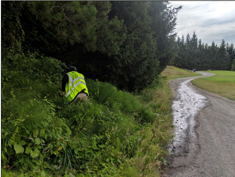
Figure N4.D-2. Wetland WSE2 and Longfellow Creek

Facing north, west of the West Seattle Golf Course 18th fairway, taken July 15, 2019.