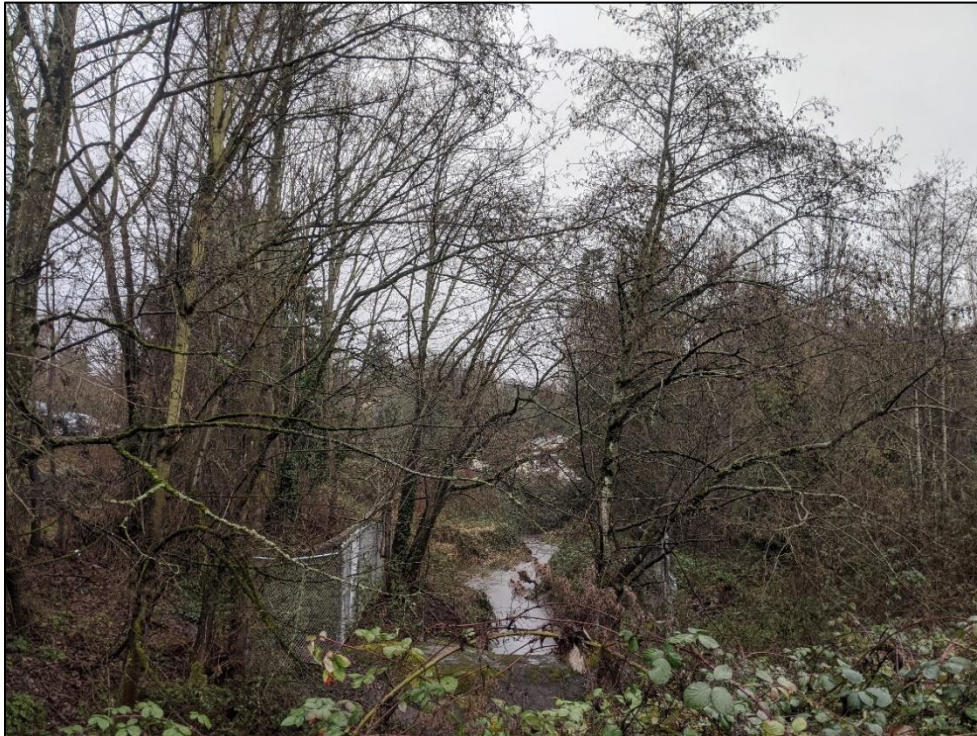
Figure N4.D-8. Duwamish Waterway – East Waterway Looking east from the Port of Seattle’s Harbor Marina Corporate Center, taken October 10, 2019.