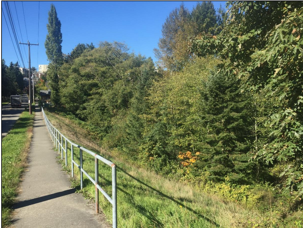
Figure N4.D-12. Delridge Community Center and Playfield From Southwest Genesee Street and 26th Avenue Southwest, taken October 10, 2019.