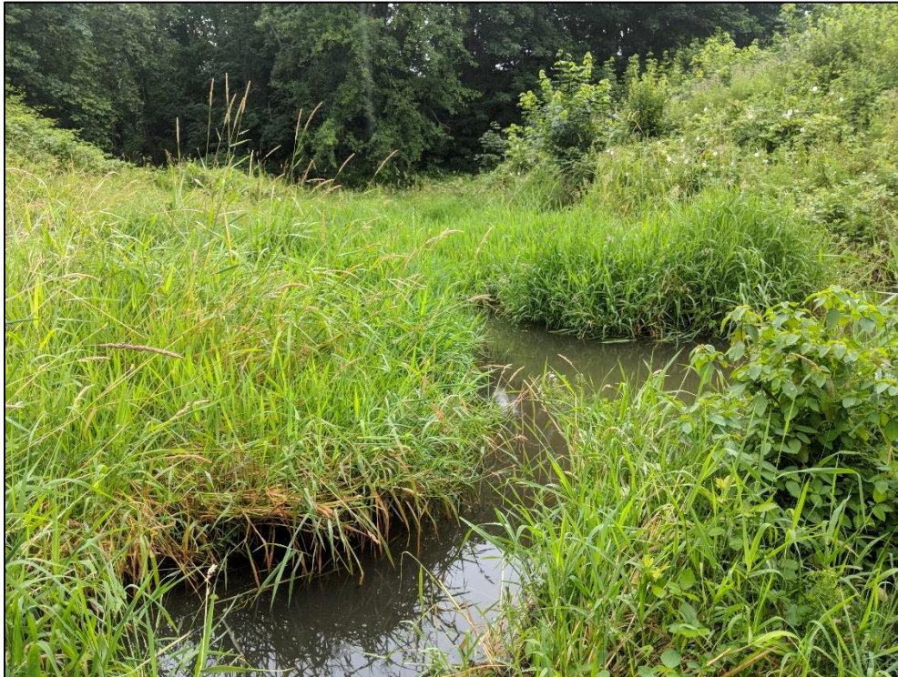
Figure N4.D-6. Longfellow Creek – Southwest Nevada Street Overpass

Facing upstream in ravine by the 13th hole, taken July 15, 2019.