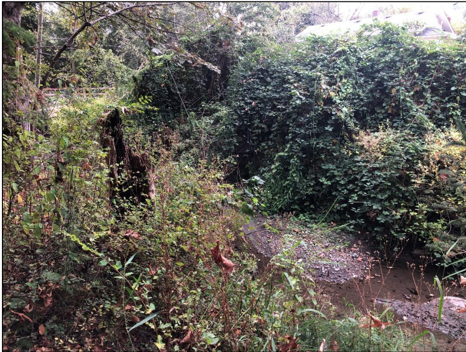
Figure N4.D-21. Wetland WSE11 near Longfellow Creek and Southwest Yancy Street

Looking north towards Yancy Pedestrian Bridge, taken October 1, 2022.