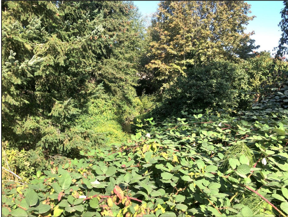
Figure N4.D-19. Longfellow Creek Area – Buffer Area on West Side of Creek near Southwest Yancy Street

Looking north from Yancy Pedestrian Bridge, taken October 1, 2022.