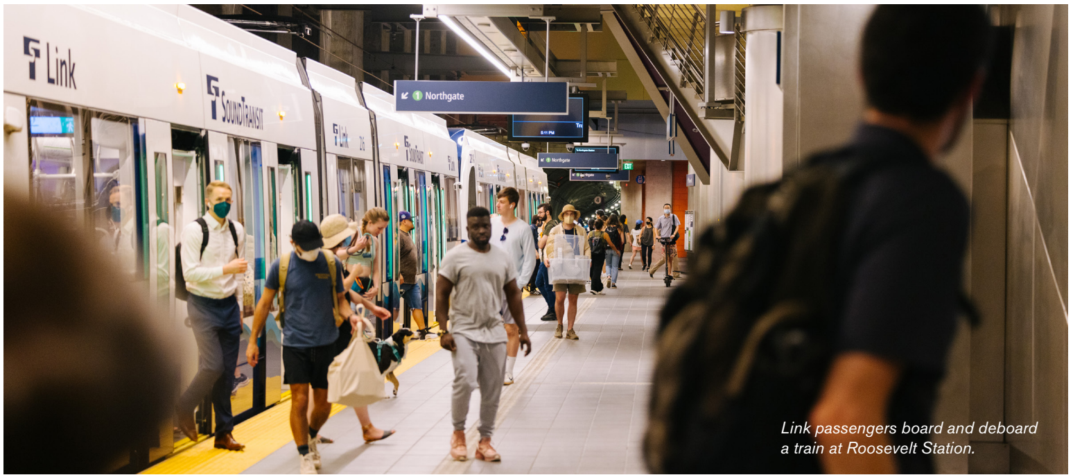
Link passengers board and disembark a train at Roosevelt Station.