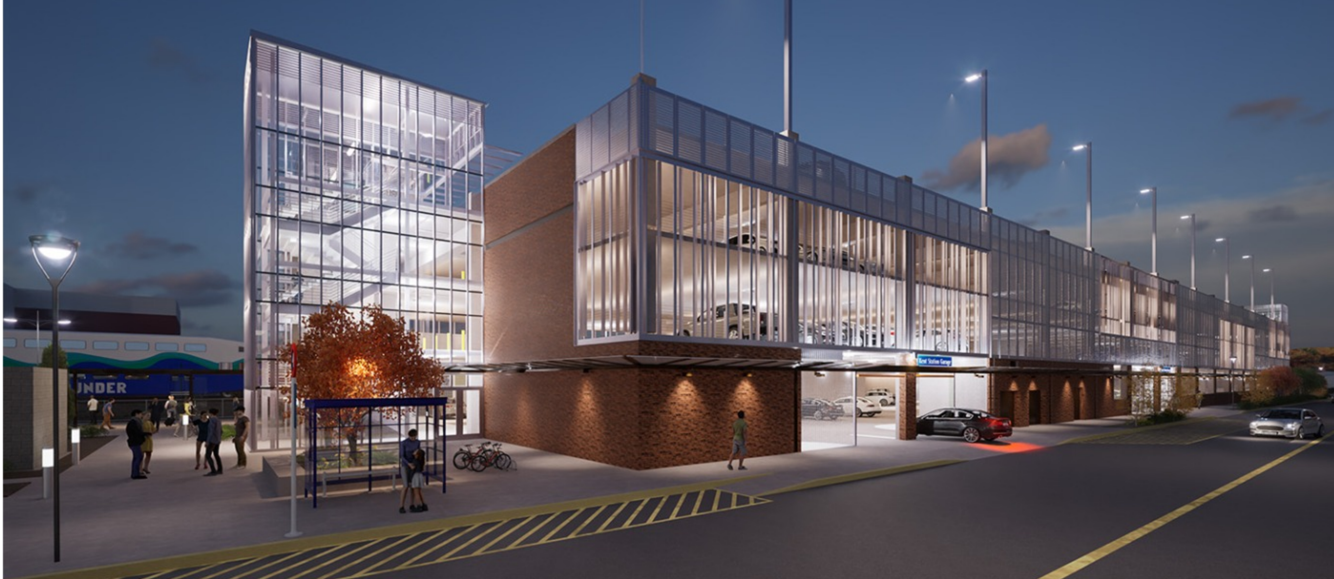
Night view of the Kent Station parking garage from the southeast corner of the site, along Railroad Ave. | Click to enlarge

In this section, you'll see artist renderings of the garage designs from several angles. Note that some details could change when we complete the final design.