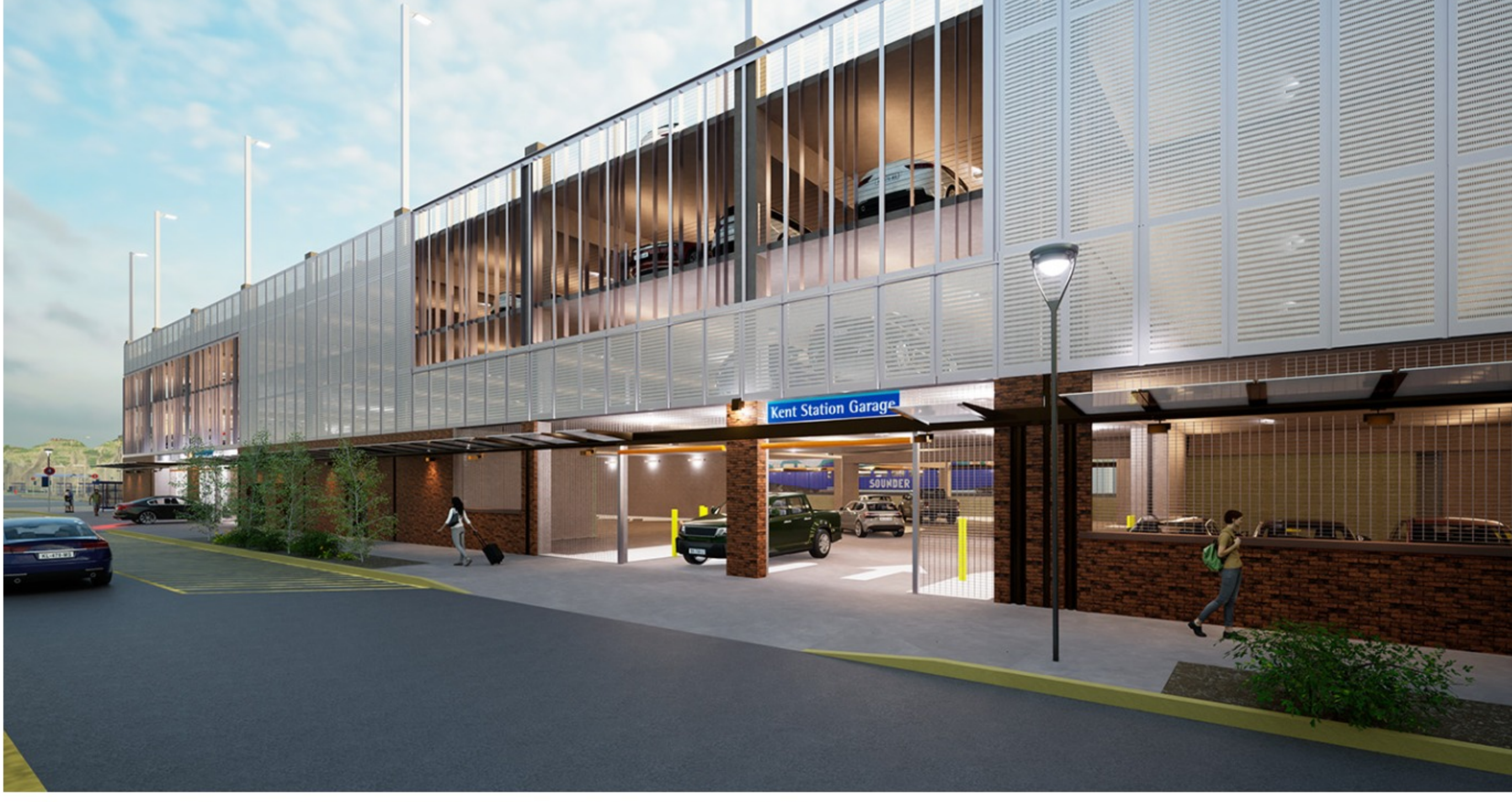
Daytime view of the Kent Station parking garage from Railroad Ave. | Click to enlarge