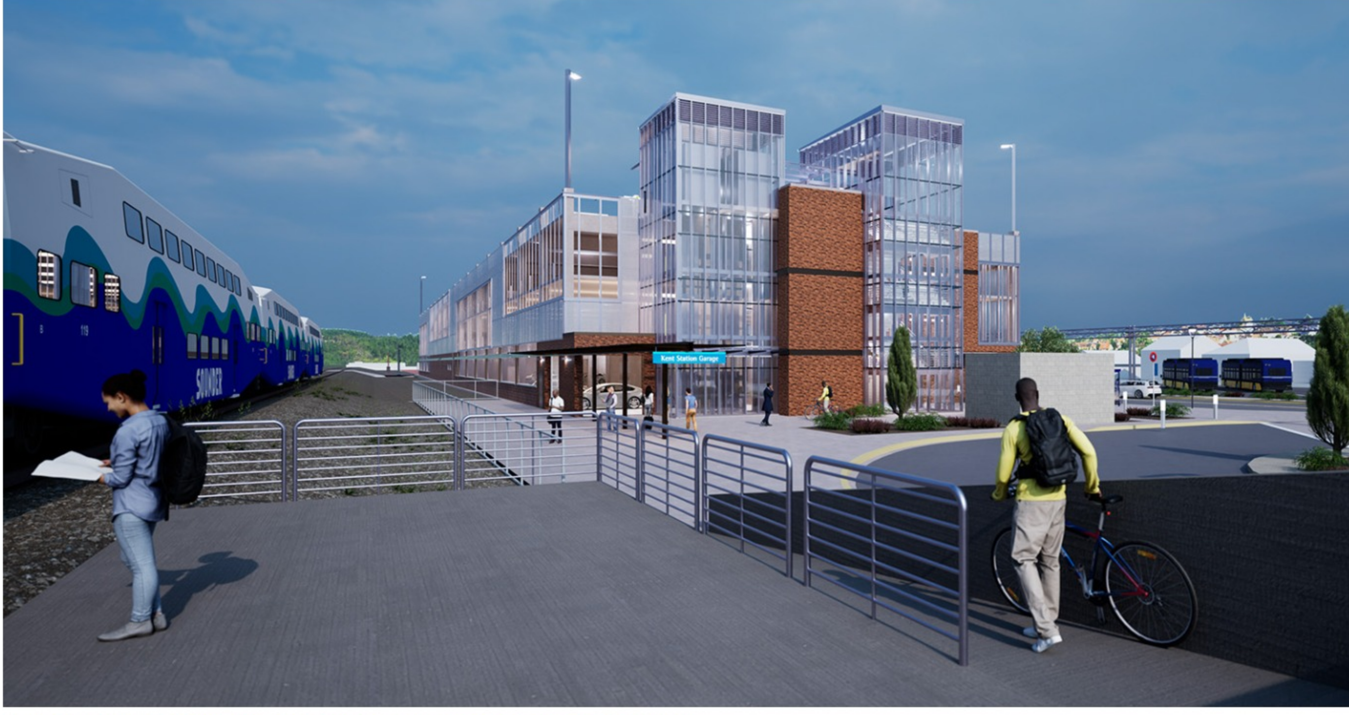
View of the Kent Station parking garage from the train platform. | Click to enlarge