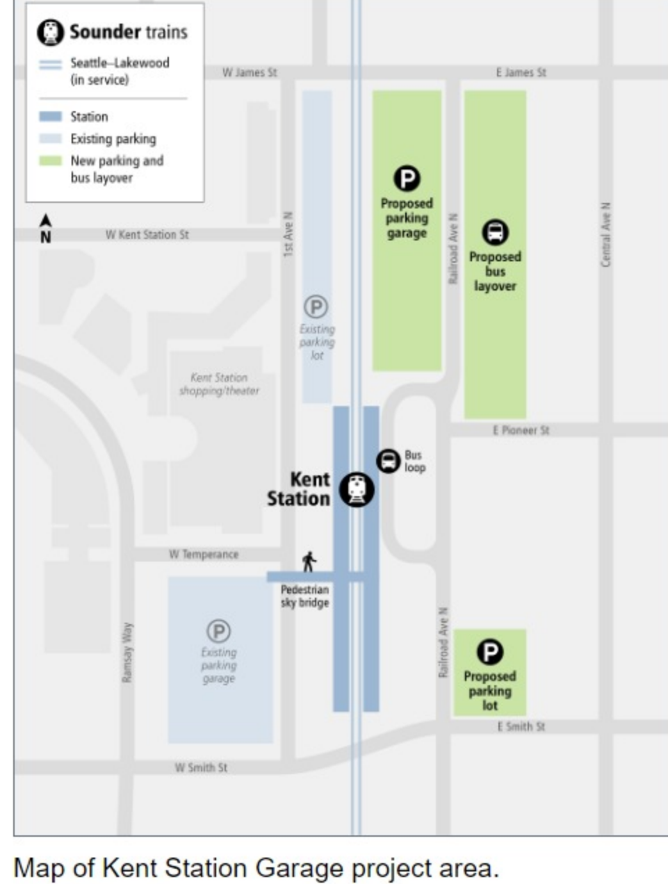
Map of Kent Station Garage project area. | Click to enlarge