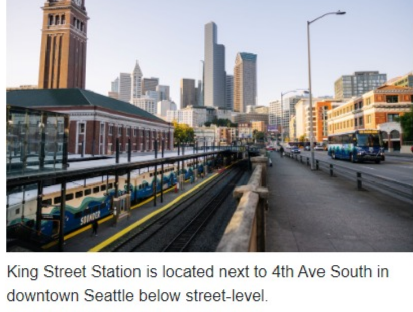
King Street Station is located next to 4th Ave South in downtown Seattle below street-level.

The BLE team and the City of Seattle are also working on a South Downtown Hub planning effort to improve accessibility through the Chinatown-International District and Pioneer Square neighborhoods and to nearby transit stations and transfer points. Learn more about the South Downton Hub from their website.