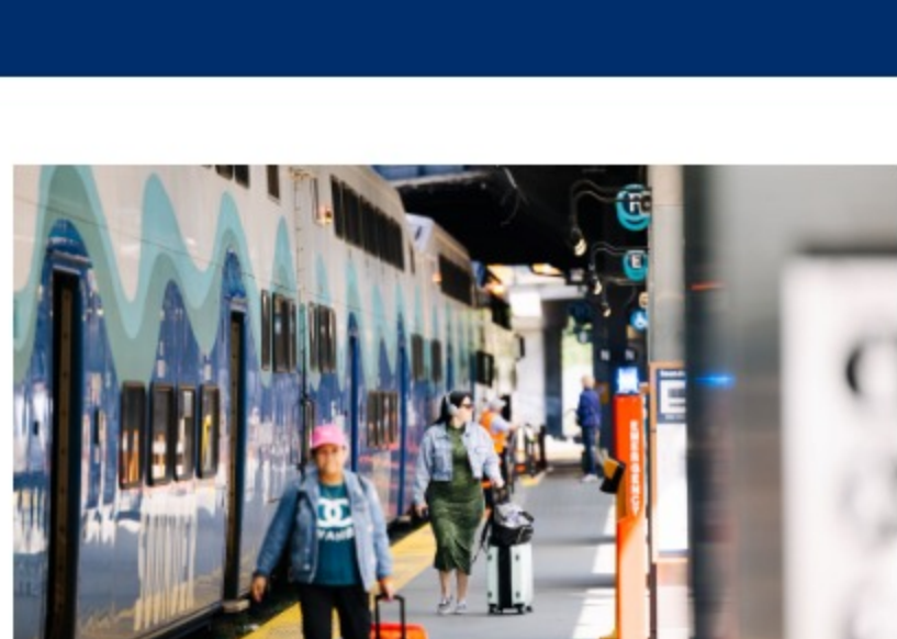
Passengers with luggage walk along the platform at King Street Station.

Sound Transit must balance a range of capital projects for South King and Pierce County subareas with available funding. The Sounder South Platform Extension project, which includes King Street Station, is planned to be completed in 2036, though we are pursuing additional funding sources so that we can deliver these improvements earlier.