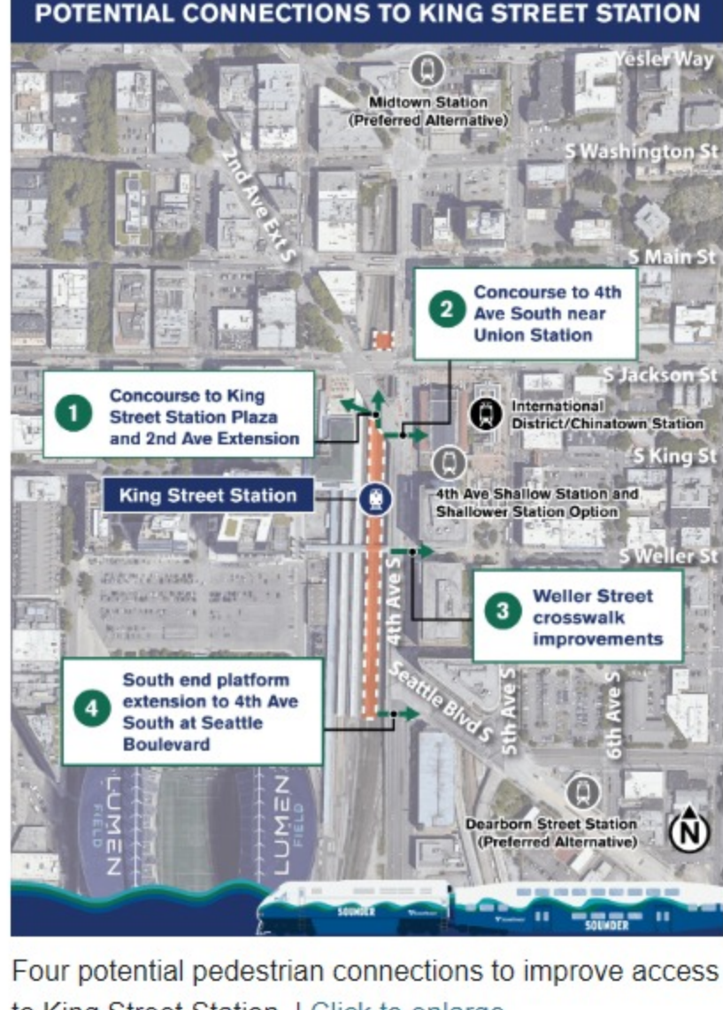
Four potential pedestrian connections to improve access to King Street Station. | Click to enlarge