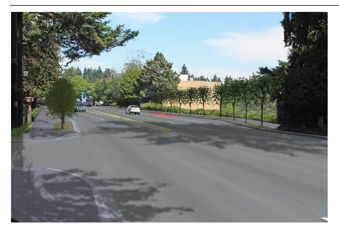
Figure 3: VP 08 — SR 523 (NE 145th Street) Looking East near 12th Avenue NE, with Project in Place

Visual and Aesthetic Resources – Additional Analysis Page 6 of 9