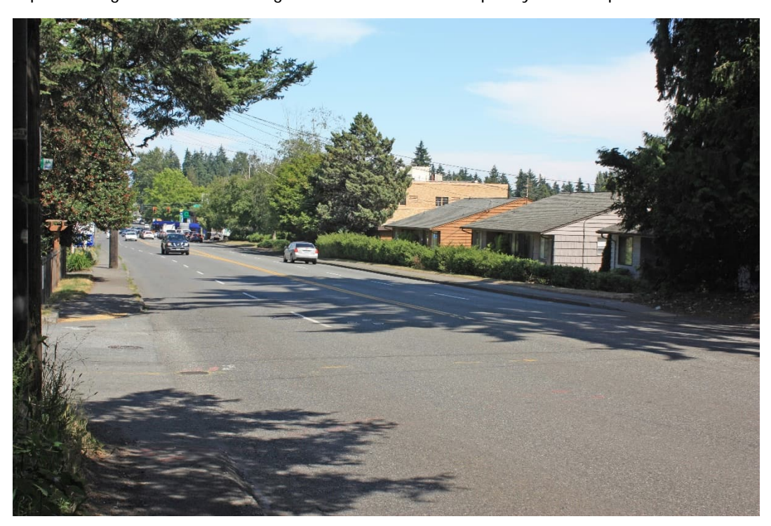
Figure 2: VP 08 — SR 523 (NE 145th Street) Looking East near 12th Avenue NE

VP 08 is a new viewpoint from SR 523 (NE 145th Street) looking east near the 12th Avenue NE intersection in Shoreline (Figure 2). This viewpoint was added to analyze impacts from removing four duplex buildings. As noted in the 2021 Visual Report, criteria for selecting viewpoints includes representing areas where "the greatest effect to visual quality" is anticipated.