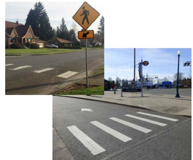
Examples of a pedestrian crossing