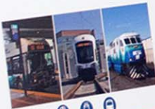
Regional Transit Long-Range Plan Update Draft Supplemental Environmental Impact Statement

The updated Long-Range Plan will form the basis for the next ballot measure (known as a system plan) that will be considered by voters.