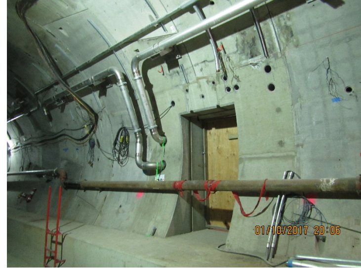
Finished cross passage