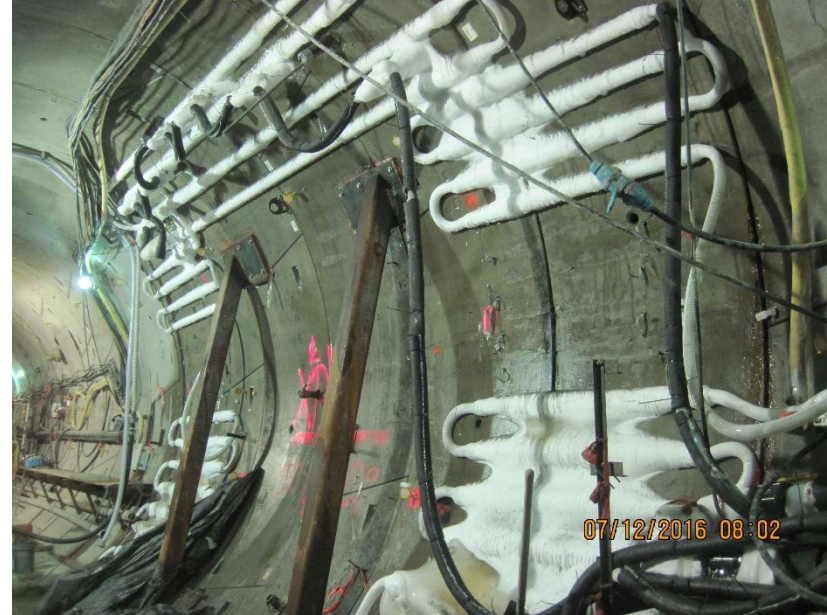
Soil freezing technology to stabilize soil