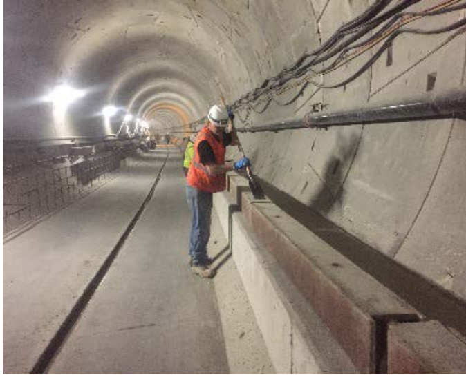
Walkways, fire standpipes, lighting & conduits