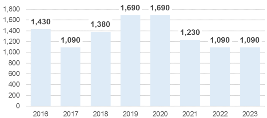
FTEs for Currently Funded Projects, 2016-2023

Sources: Sound Transit, 2016; Community Attributes Inc., 2016.