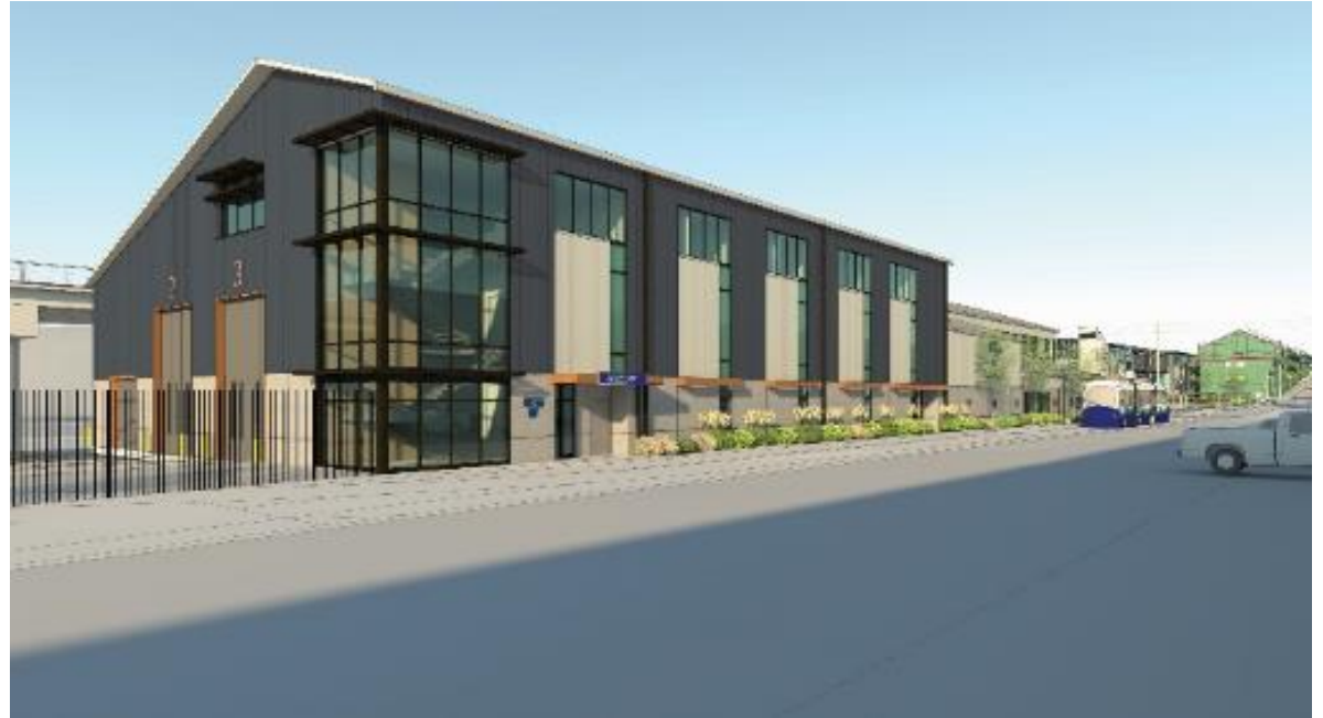
Architect rendering of expanded Operations and Maintenance Facility