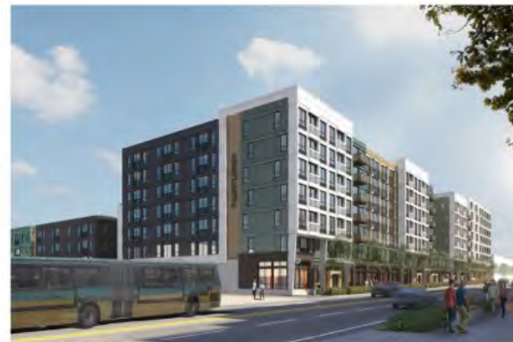
The seven story 306 apartment project at 4722 Fauntleroy Way SW will feature a 306-unit mix of one- and two-bedroom residences, as well as studios and live-work units.

306 unit apartment development on Fauntleroy way finally underway; Demolition happening