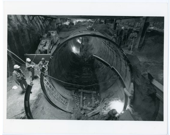
Launch Tube of Boring Machine, Pioneer Station, 1980s