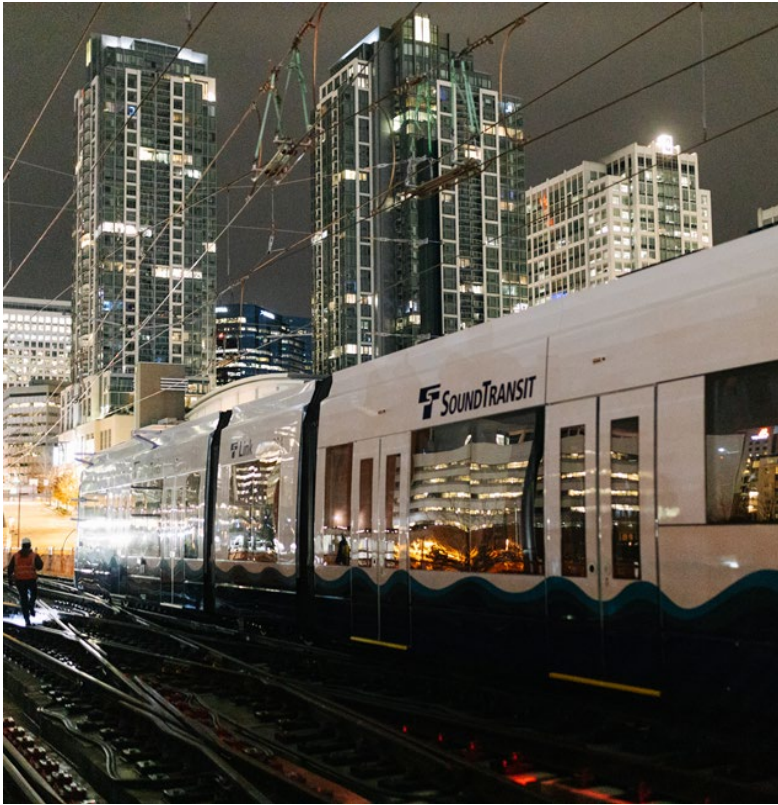
Link Train Entering Bellevue Station