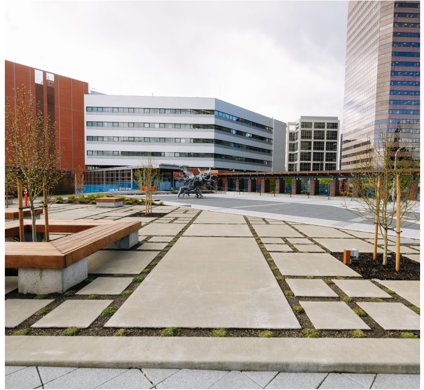
Bellevue City Hall Plaza